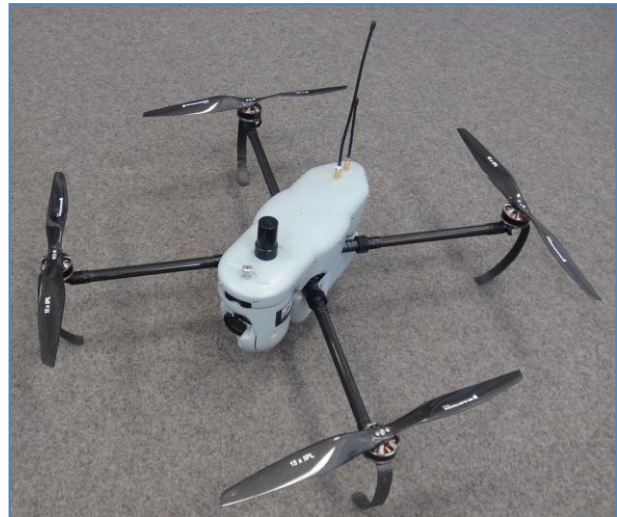
Fig. 2 Final shape of the quadrotor airframe

After several iterations the designers decided to use the cross-shape of the airframe (Fig. 2).