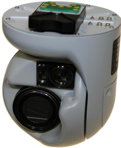
Fig. 4 Stabilised photo camera with laser range finder

The Ground Control Station (GCS) was built using a Getac E 110 ruggedized tablet (Fig. 5).