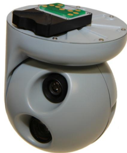
Fig. 3 Day/night video stabilised camera

Total weight of the platform with batteries for 35 minutes of flight and electro-optical payload was around 3 kg. The payload included a day-night video camera (Fig. 3) or a photo camera with laser range finder (Fig. 4)