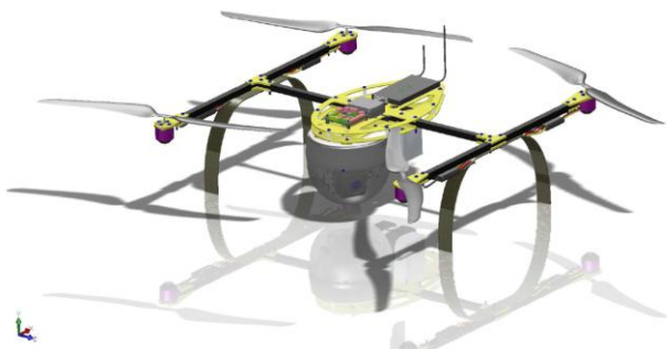
Fig. 1 One on quadrotor airframe designs investigated during project

During the project several ideas for the main airframe were tested, among others was the airframe in shape of an H letter (Fig. 1)