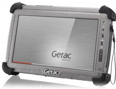
Fig. 5 Getac E110 tablet used for quadrotor ground station

The Ground Control Station (GCS) was built using a Getac E 110 ruggedized tablet (Fig. 5).