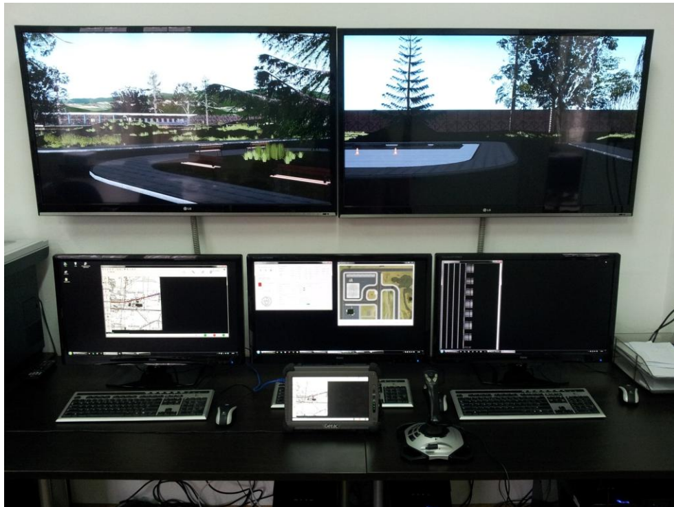
Fig. 6 Training simulator of the unmanned system

In the simulator a non-linear model of a quadrotor was implemented with an automatic flight control system. Architecture of the simulated autopilot was similar to actual concept developed by WB Electronics and it is prepared to cooperate with a dedicated GCS. The differences between real and simulator autopilots stem from the need to adjust the autopilot to the simulation environment and to the structure of dynamics model.