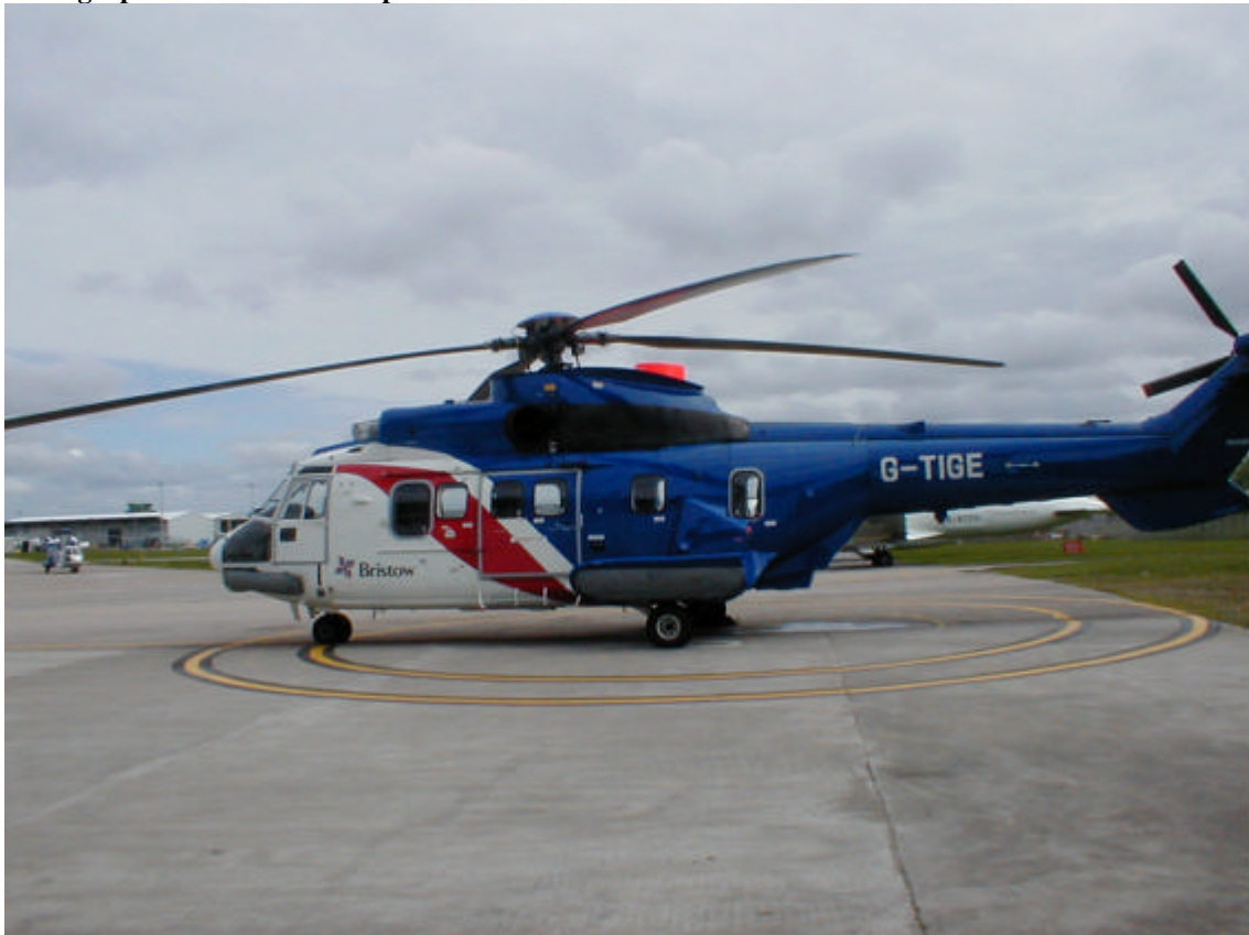
Photograph 1: The first helicopter in the world certified with TCAS II