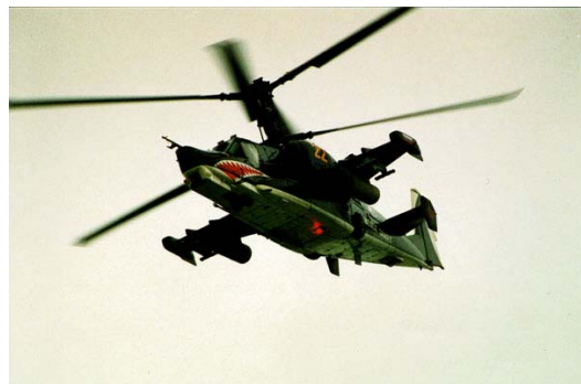
Fig. 1. Ka-50 Black Shark helicopter

Ka-50 Black Shark (Fig. 1) is a single-seat attack helicopter for destroying armoured vehicles, slow-speed air targets and manpower on the battlefield.