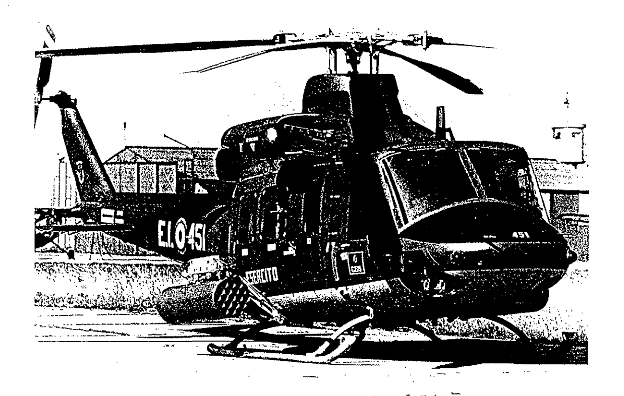
AB 412 GRIFFON