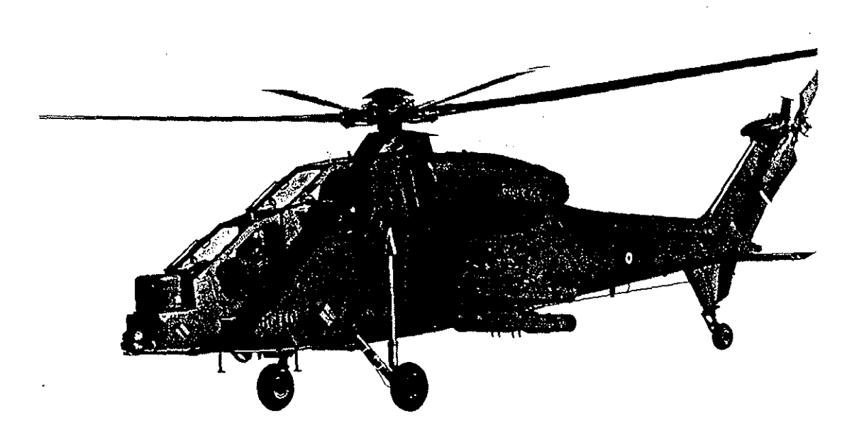
A 129 MONGOOSE